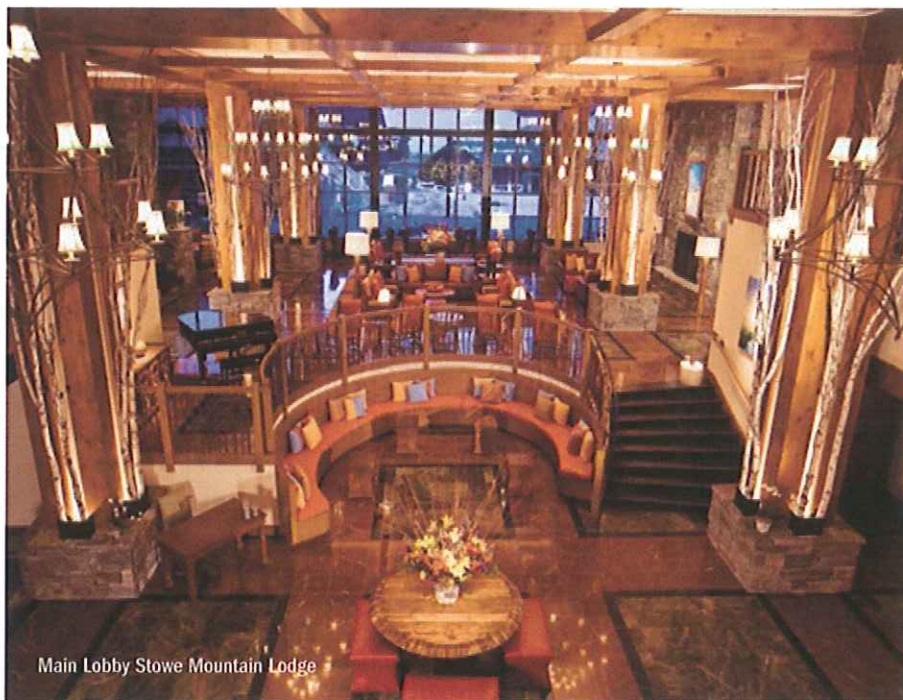
Main Lobby Stowe Mountain Lodge

Dining. Solstice offers Vermont farm-to-table cuisine in an elegant, yet casual and comfortable setting. Breakfast, lunch and dinner are served. Four- and seven-course tasting dinners are offered, in addition to an à la carte menu. On select Saturday evenings, ride the Stowe Gondola up to the top of Vermont’s highest peak to dine mountainside at Cliff House Restaurant.